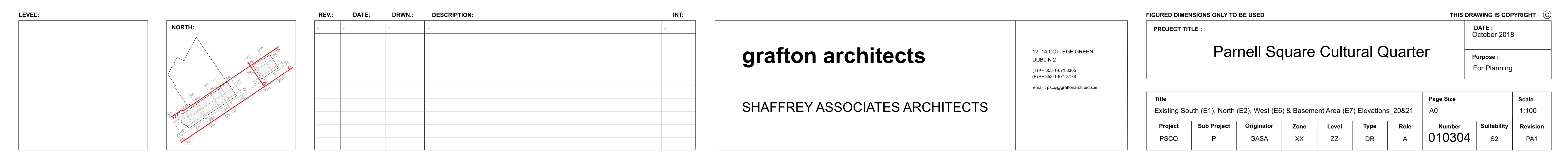
Existing West Elevation (E6)_20&21